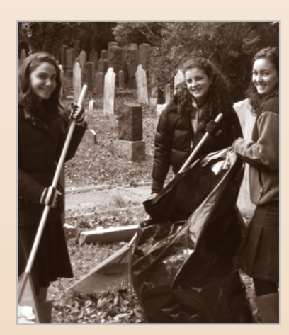
Students from Stella K. Abraham High School for Girls