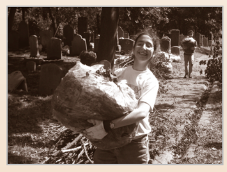
Students and parents from SAR Academy

...FOR RAKING LEAVES AND CLEARING DEBRIS AT SILVER LAKE CEMETERY THIS FALL