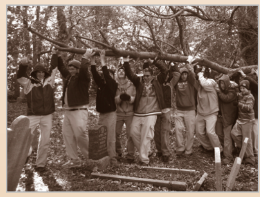
Sudents from Davis Renov Stahler Yeshiva High School for Boys