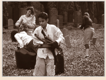
Students from North Shore Hebrew Academy Middle School