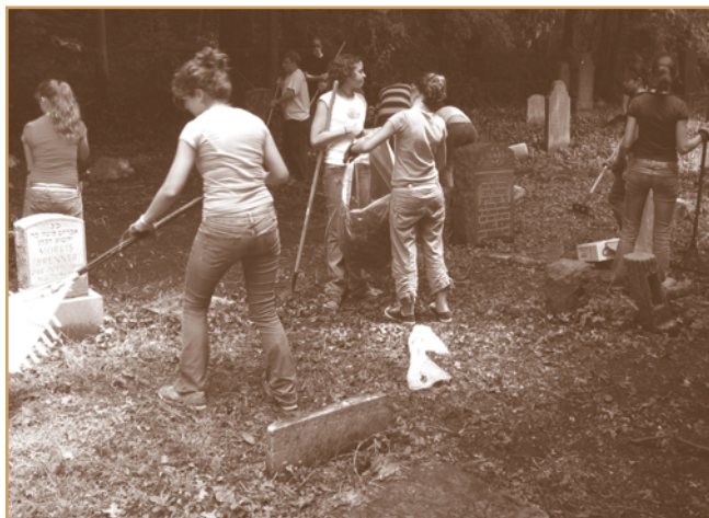
Members of the Park Avenue Synagogue Men's Club cleaning at Silver Lake