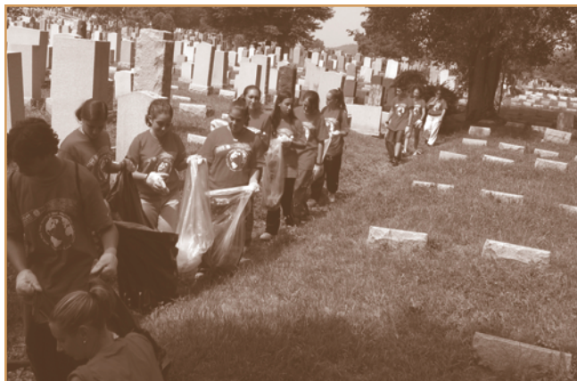
The CIT's of JCC of Staten Island Lillian Schwartz Day Camp cleaning debris at Mt. Richmond Cemetery