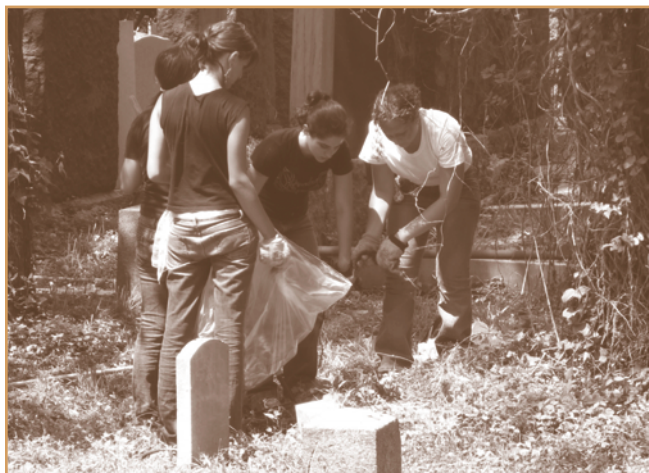
Campers from Young Judaea's Camp Tel Yehudah spending 4 days clearing debris at Silver Lake Cemetery