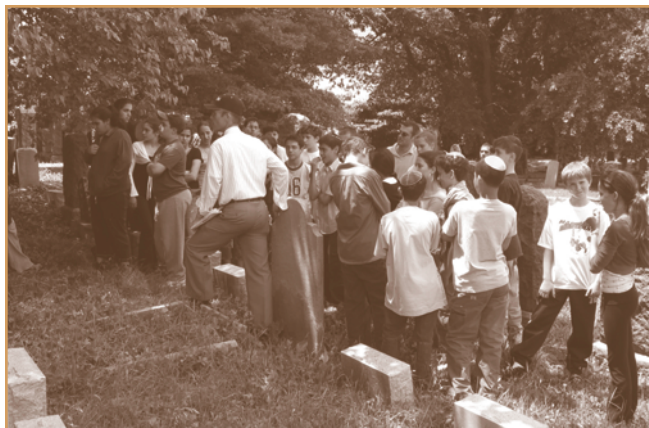
Students from Solomon Schechter School of Queens marking graves for grave care at Mt. Richmond Cemetery