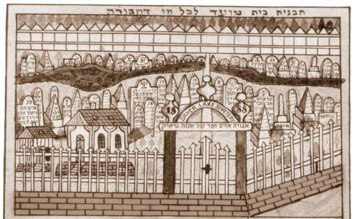
HFBA 1901 archival image

An important non-invasive geophysical survey of the cemetery was completed, resulting in the identification of 223 rows of marked and unmarked graves. In most locations, individual graves could not be precisely designated although the rows of burials were easily detected. An archaeologist is verifying and consolidating the information from the new surveys with HFBA's archival data, and will prepare an index to identify specific graves as holding particular remains. However, because the cemetery was filled with thousands of graves spaced closely together over a relatively short period of less than twenty years, and because it appears that small graves for children were inserted between graves for adults, the accuracy of the historic record is unclear. It is hoped that with more research, it will be possible to erect memorial markers with the names of the decedents buried in each row, if not in a particular grave.