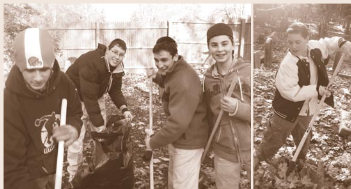
ROSENBAUM YESHIVA OF NORTH JERSEY