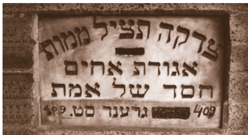
Original pushka from 1909 at HFBA’s Mount Richmond Cemetery

GET INVOLVED as a professional with HFBA by donating your expertise and skills in an area that can help us.