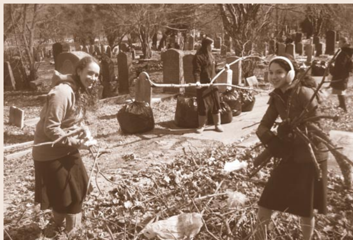
MA'AYNOT YESHIVA HIGH SCHOOL FOR GIRLS