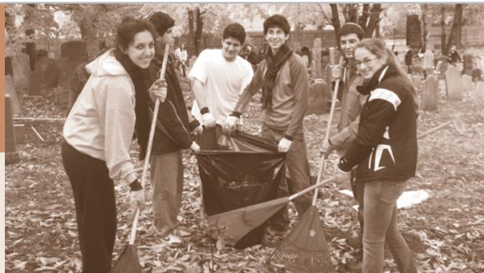
ABRAHAM JOSHUA HESCHEL HIGH SCHOOL OF MANHATTAN

We encourage you to call our office to volunteer your time as an individual or as part of a group to help clean, clear and maintain our Silver Lake Cemetery in Staten Island.