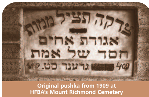
Original pushka from 1909 at HFBA's Mount Richmond Cemetery

GET INVOLVED as a professional with HFBA by donating your expertise and skills in an area that can help us.