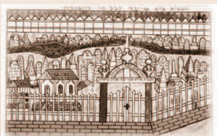
HFBA archival image of Silver Lake Cemetery

Thank you in advance for participating in this most important mitzvah !