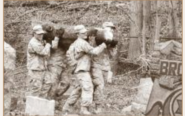
Cadets removing a section of a fallen tree in Silver Lake Cemetery.

We especially want to acknowledge the group of cadets from United States Military Academy at West Point.