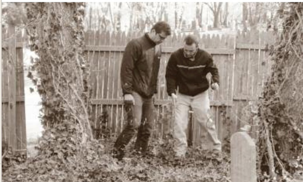
Geophysical engineers from Nova Geophysical Services marking grave rows in Silver Lake Cemetery.

Silver Lake Cemetery, HFBA's first acquisition, opened in 1893 and was full by 1909. Over the many years since, environmental issues have challenged its conservation. Now, thanks to initial funding from a generous donor who wishes to remain anonymous, HFBA has embarked on an ambitious project to rehabilitate and restore these historic grounds.