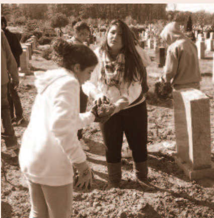
Solomon Schechter School of Queens

Thank you and tizku l'mitzvot (may you merit the opportunity to do more good deeds)!