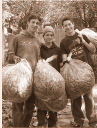
North Shore Hebrew Academy High School