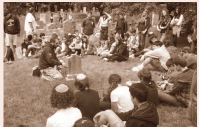
Solomon Schechter School of Westchester

Thank you and tizku l'mitzvot (may you merit the opportunity to do more good deeds)!