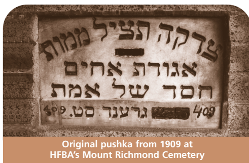
Original pushka from 1909 at HFBA's Mount Richmond Cemetery

GET INVOLVED as a professional with HFBA by donating your expertise and skills in an area that can help us.