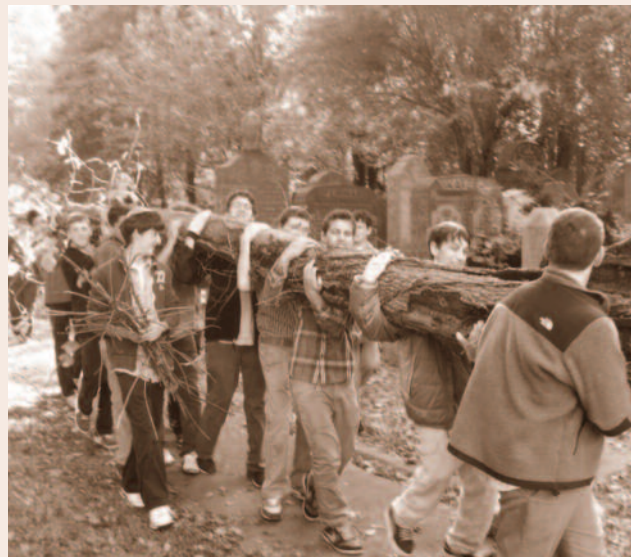
Davis Renov Stahler Yeshiva High School (DRS)