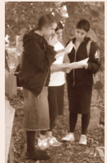
Stella K. Abraham Yeshiva High School (SKA)