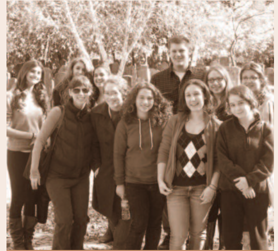
Brooklyn Heights Group of Synagogue Youth