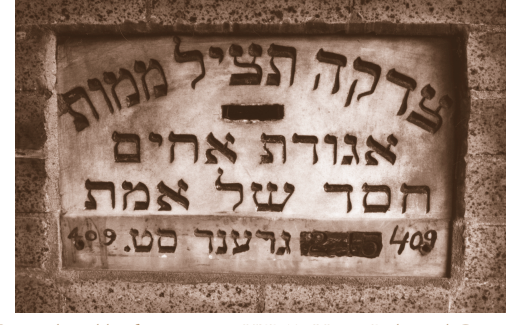
Original pushka from 1909 at HFBA's Mount Richmond Cemetery

GET INVOLVED as a professional with HFBA by donating your expertise and skills in an area that can help us.