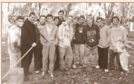
JEWISH EDUCATIONAL CENTER (RTMA)