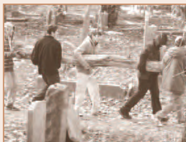
DAVIS RENOV STAHLER YESHIVA HIGH SCHOOL (DRS)