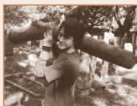
BROOKLYN HEIGHTS GROUP OF SYNAGOGUE YOUTH (BHGSY)