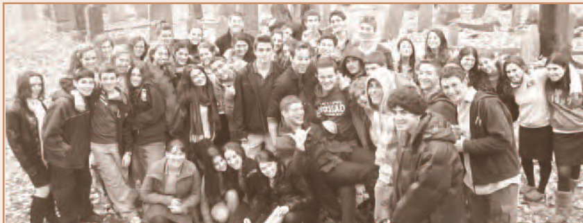
THE FRISCH SCHOOL