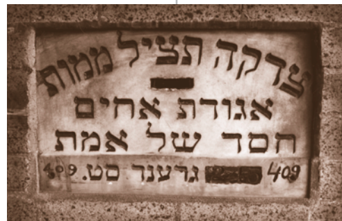
Original pushka from 1909 at HFBA's Mount Richmond Cemetery

GET INVOLVED as a professional with HFBA by donating your expertise and skills in an area that can help us.