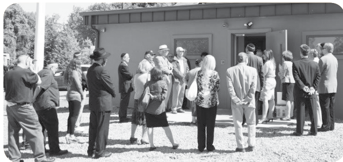
Guests at Mount Richmond Cemetery tahara facility dedication, June 1, 2014.

HFBA now has a new state-of-the-art tahara facility at Mount Richmond Cemetery located in an addition to the original stone cutter's workshop in which grave markers were made decades ago.