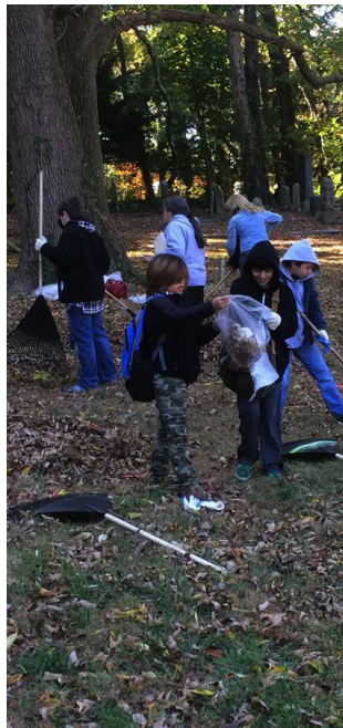
The Reform Temple of Forest Hills Religious School