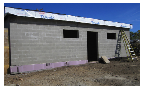
Tahara facility under construction