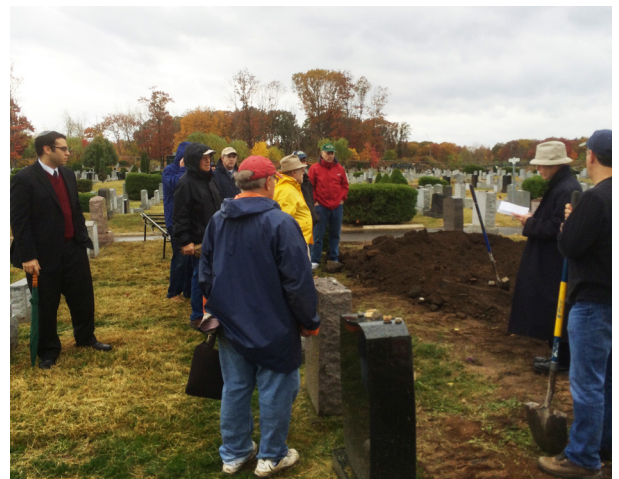
HFBA volunteer minyan at a burial.