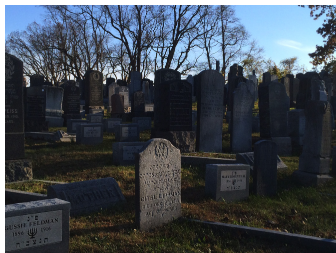
Mount Richmond Cemetery