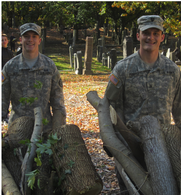
Parshat Chayei Sara Community Chesed Day, October 2013, West Point cadets.