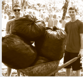
The Heschel School

And a special thank you to all of the volunteers who attended our Spring Community Chesed Day.