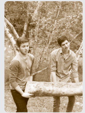
The Frisch School