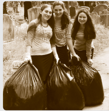
Stella K. Abraham High School for Girls