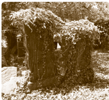
▲ Before and After ▼

As they ate, forgotten graves appeared where they were previously obscured by the foliage, and the area became clearer, cleaner and more hospitable to those who visit or work in the cemetery.