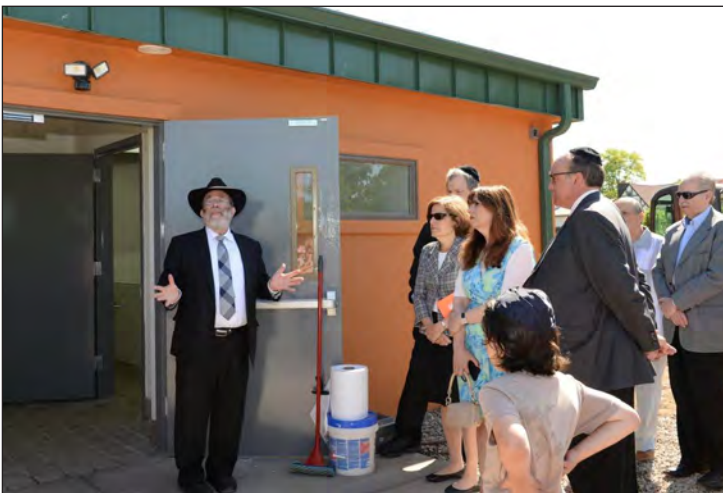
TAHARA FACILITY DEDICATION