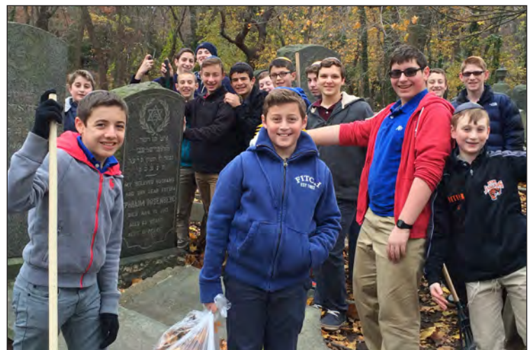
ROSENBAUM YESHIVA OF NORTH JERSEY