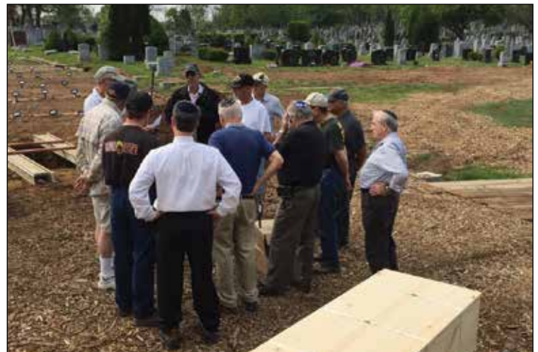
HFBA'S VOLUNTEER MINYAN AT MOUNT RICHMOND CEMETERY