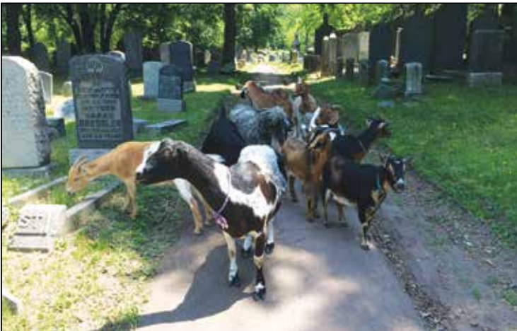
GOATS AT SILVER LAKE CEMETERY