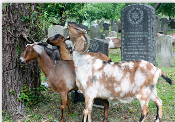
GOATS AT SILVER LAKE CEMETERY