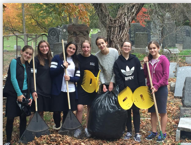
STUDENTS FROM THE FRISCH SCHOOL VOLUNTEERING AT SILVER LAKE CEMETERY